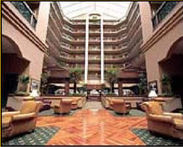
Northland Inn Hotel and Conference Center